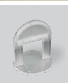
Art. 170/B Spacer base