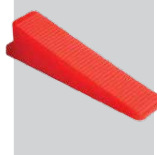
Art.170/C Spacer wedge